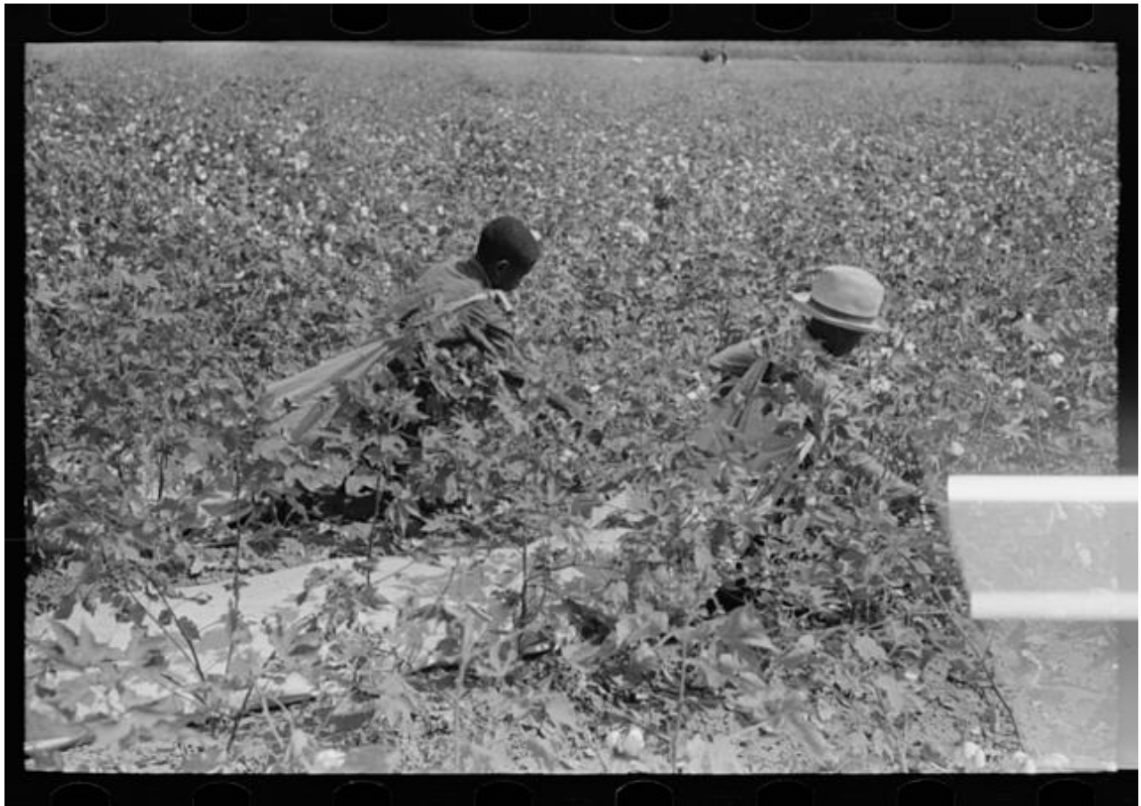
Figure 1: [Untitled photo, possibly related to: Picking cotton near Lehi, Arkansas]. Arkansas Lehi, 1938. [Sept] Photograph. Retrieved from the Library of Congress, https://www.loc.gov/item/fsa1997023475/PP/. (accessed March 25, 2017.)

The photos below are examples of the nature of child labor in southern agriculture. The children in Figure 1 are picking cotton, which would normally take place in September or October. They appear to be elementary age, meaning they probably missed a crucial element of their primary education if a school was available. The children in Figure 2 were photographed in June when school was out of session. Still, their ages range from eight to thirteen, hardly ages at which children should be expected to perform physical labor.