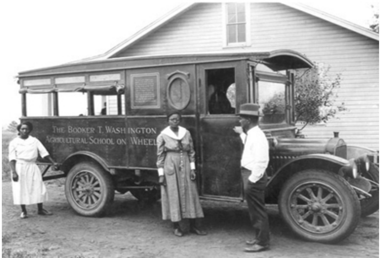
Figure 3: Tuskegee Institute "Movable School"