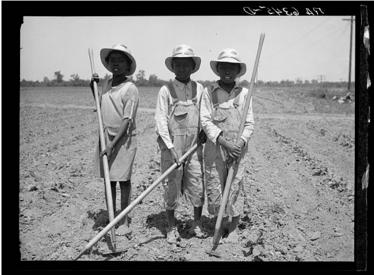
Figure 2: Children chopping cotton. Near Marked Tree, Arkansas. Ages, left to right: ten years, thirteen years, eight years. Arkansas Marked Tree Poinsett County, 1936. June. Photograph.